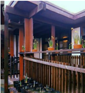
Mill Lane Garden Centre The Open Space 160 Mill Lane NW6 1TF