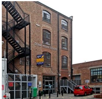
Mailout 27a Greenwood Place NW5 1LB