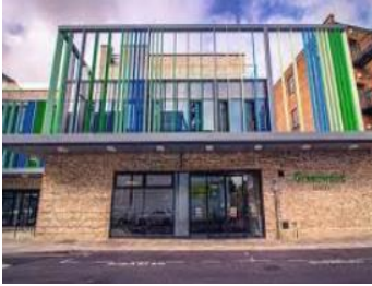
Greenwood Café 37 Greenwood Place NW5 1LB