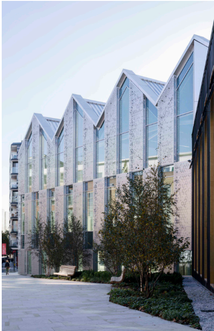
22 Handyside Street, Coffey Architects