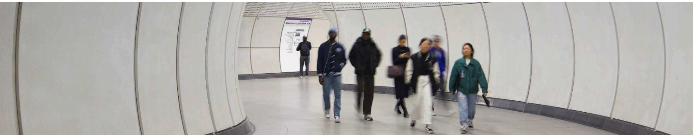
Tottenham Court Road Station design by Hawkins\Brown. Tunnels and Linewide design led by Grimshaw © Photo by Hufton + Crow.

Large projects, for example schemes with several development plots, may be split into smaller elements for the purposes of review, to ensure that each component receives adequate time for discussion.