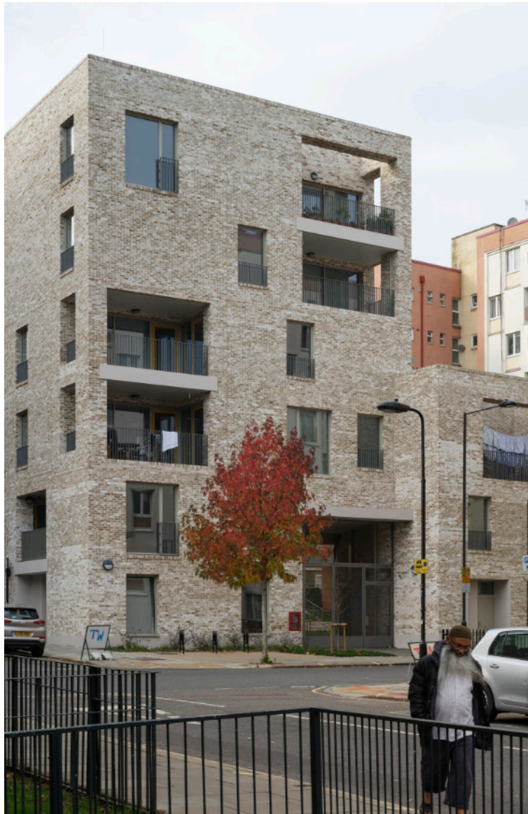
Caudale, Mæ Architects RIBA National Winner 2021 / RIBA London Regional Winner 2021