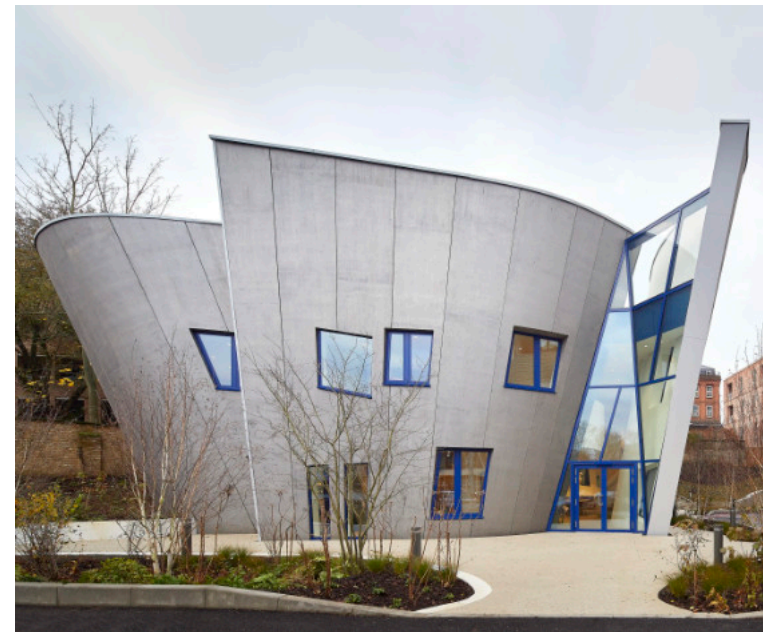
Maggie's Royal Free Hospital, Daniel Libeskind

As a public authority, Camden Council is subject to the Freedom of Information Act 2000 (the Act). All requests made to the Council for information with regard to the Design Review Panel will be handled according to the provisions of the Act. Legal advice may be required on a case by case basis to establish whether any exemptions apply under the Act.