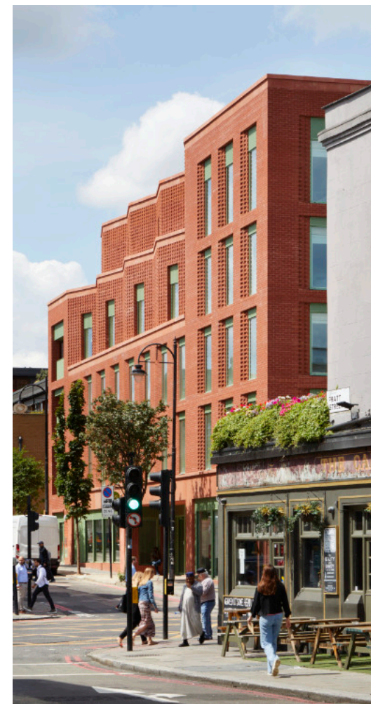
Camden Hub Hotel, Morris and Compnay

The panel will not duplicate or replace existing mechanisms for securing high quality design. It is intended to provide additional expert advice to inform the planning process. By offering advice to applicants during the pre-application process, and by commenting on planning applications, the panel will support Camden's planning officers and committee in securing high quality development.