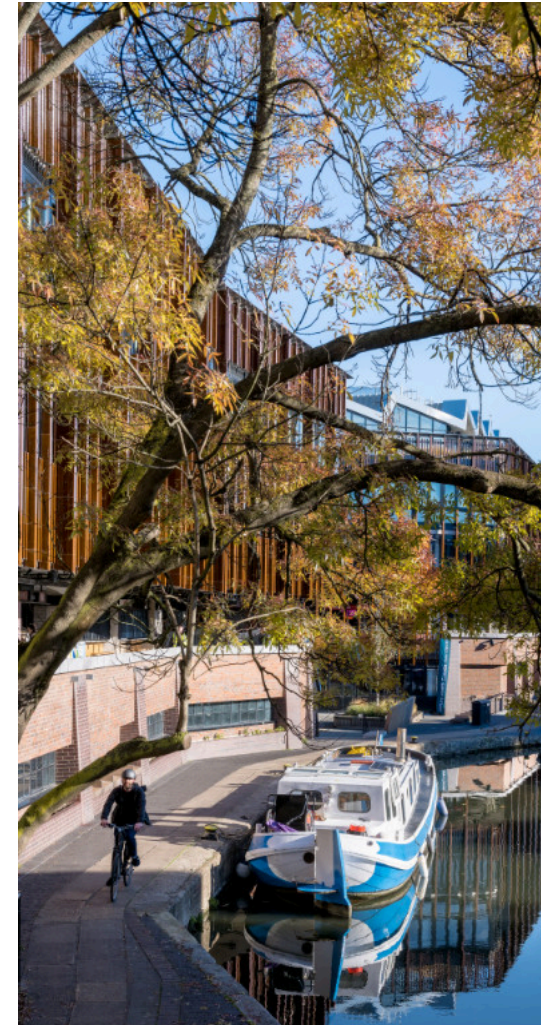
Hawley Wharf, Allford Hall Monaghan Morris Housing Design Awards 2021 - Winner of Winners / RIBA Region London Awards 2022

www.london.gov.uk/sites/default/files/ggbd_london_design_review_charter_jan22.pdf