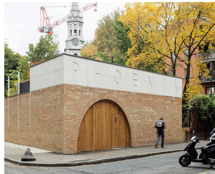
Phoenix Garden Community Centre, Office Sian Architecture + Design RIBA London Award 2021 / Camden Design Award 2017 / Camden Design Award 2022

As part of this annual review process, a meeting will be held with key Camden Council officers and the panel co-chairs to discuss the report and consider any recommendations for the following year.