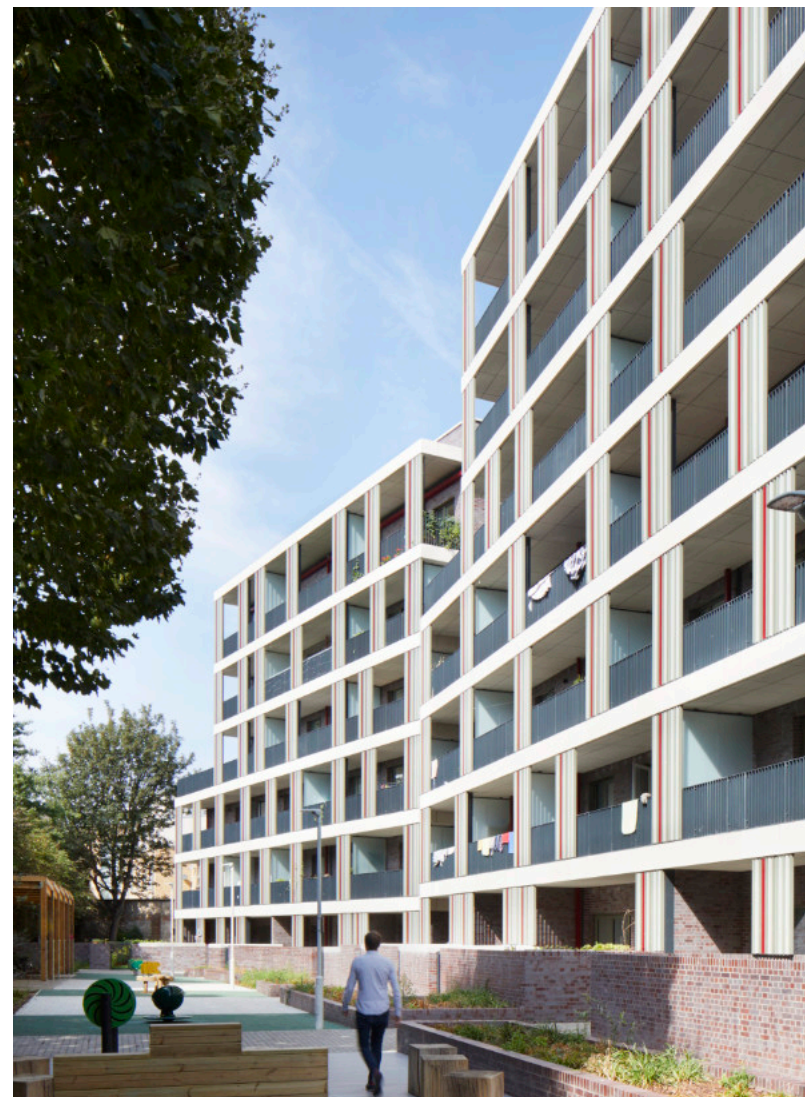
Agar Grove, for London Borough of Camden by Hawkins\Brown NLA Awards 2019 - Sustainability Prize and Overall Winner / Camden Design Awards Winner 2019 / CIBSE Awards 2020 - Project of the Year Residential / London Planning Awards 2019 - The Mayor's Award for Sustainable and Environmental Planning and Good Growth / Housing Design Awards 2015 - Project Schemes Winner