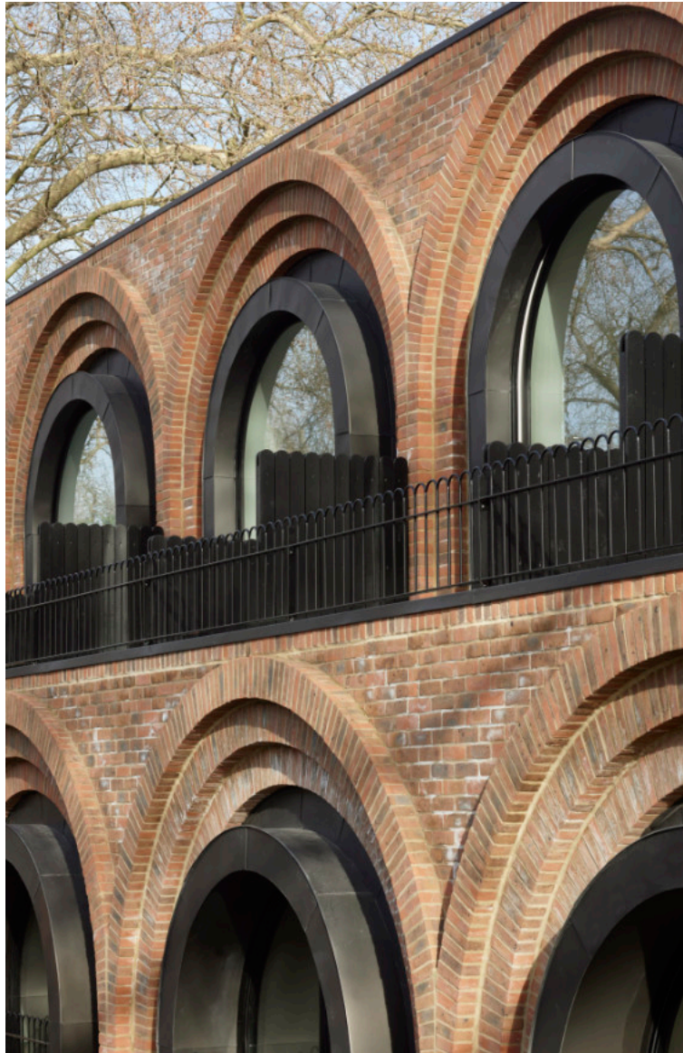
The Arches, DHaus Company