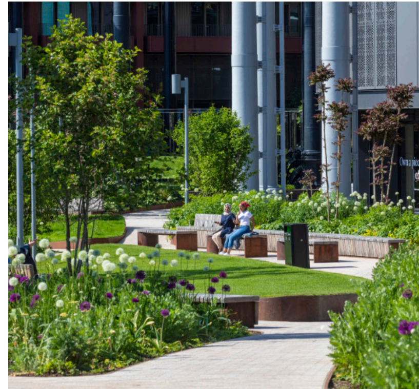
King's Cross Central, by Argent, Townshend Landscape Architects and Dan Pearson Studio © John Sturrock / Civic Trust Award 2019 / New London Architecture Award 2019

https://www.designcouncil.org.uk/fileadmin/uploads/dc/Documents/Design%2520Review_Principles%2520and%2520Practice_May2019.pdf