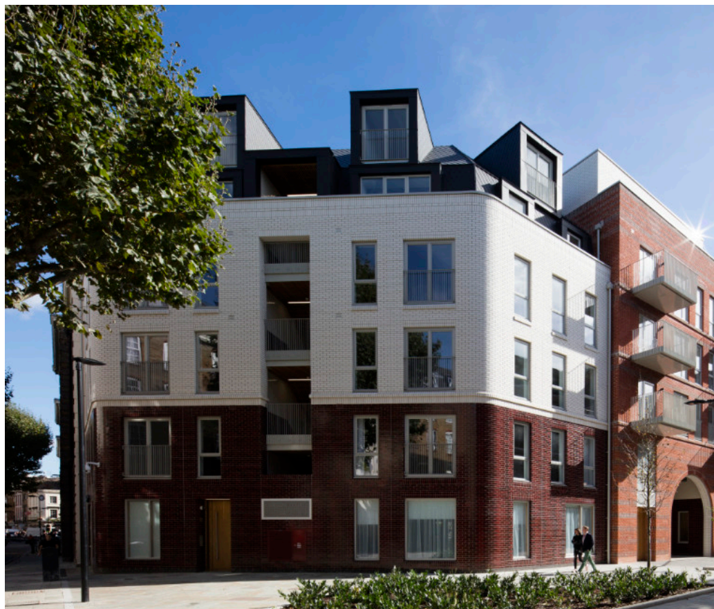
Bourne Estate, Matthew Lloyd Architects for Camden Council Overall Winner – Housing Design Awards 2018 RIBA Award 2018 – London Region / New London Architecture Award 2018 / Camden Design Award 2017

Any subsequent reviews will be charged for at the applicable rate (detailed in Section 15).