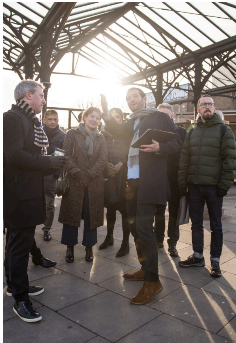
Camden Design Review Panel site visit

From time to time, it may be of benefit for specialist advice to be provided beyond the panel membership. In such cases, a professional with the relevant expertise may be invited to attend a review meeting, participating in the discussion with the status of an adviser to the panel.