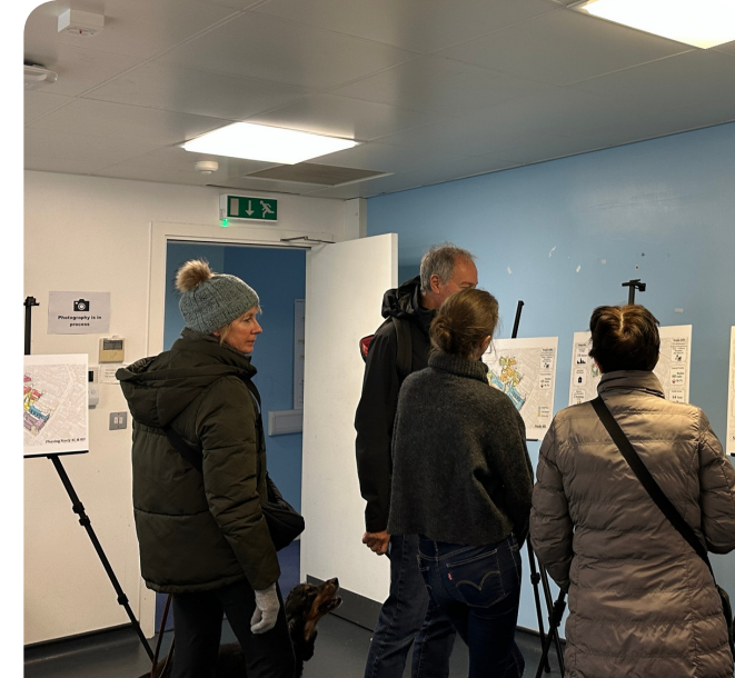
Residents at our January drop in sessions