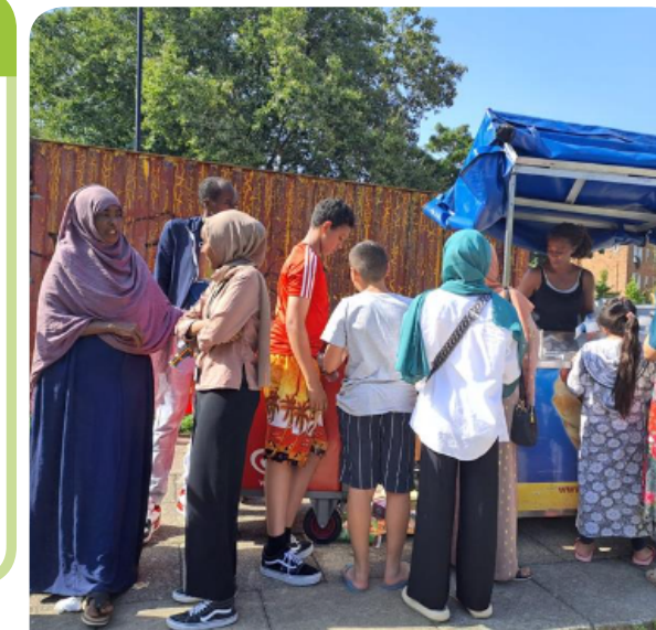
Residents at our September Fun Day event